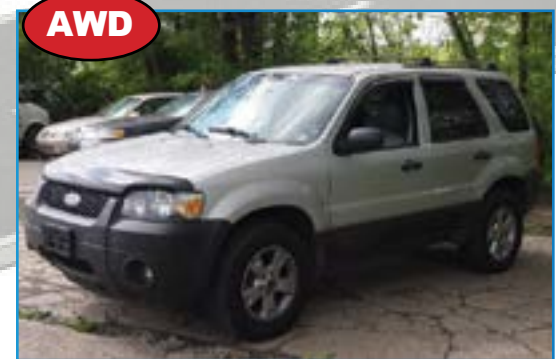
2005 FORD ESCAPE Stock #F27308 $6990