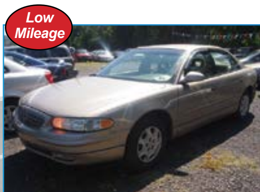
2003 BUICK REGAL LS Auto, 67K, Stock #F21662 $5990