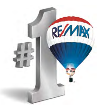
Each Office Independently Owned and Operated

For up-to-date information from your Penn Estates Specialists, call today!