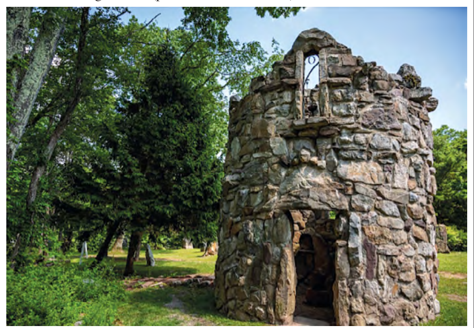
One of the many structures at Columcille in Bangor PA.

August 1st is the Gaelic celebration of the beginning of the harvest season, with a yearly harvest festival celebrating an abundance in life, and good times for the future. What is this festival you ask? It is the Irish festival of harvest and abundance called Lughnasadh (pronounced: Loo na sah).